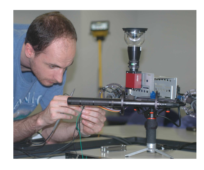
Figure 1: A 360-degree camera surrounded by a ring of microphones provides a view of all participants at the meeting

The small 360-degree video camera is placed in the centre of the meeting table above a ring of directional microphones, in a windmill configuration, to collect a stream of audio-visual information from which to characterise the discourse events of the meeting. The video signal is of relatively low resolution (see figures 3 and 4), so fine details such as eye-gaze and direction are not available to the system in its present design (and will perhaps not be necessary). Instead, gross movements are detected from the skin tone areas and, from these, a set of primitive features de-