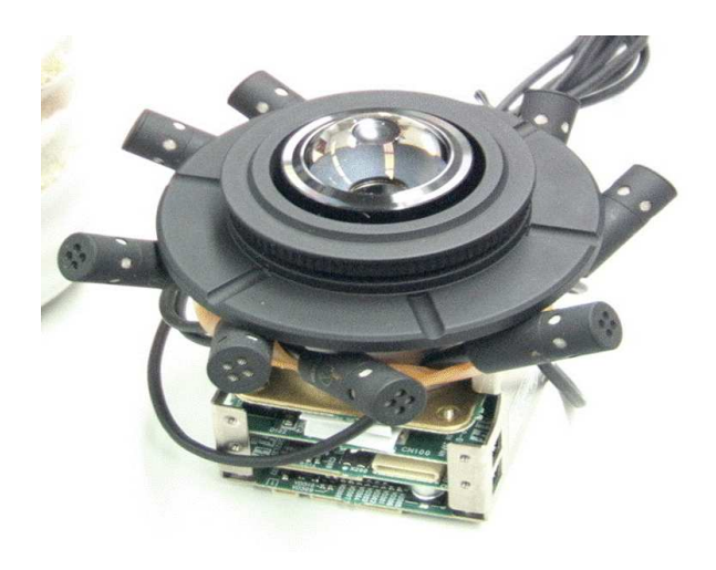
Figure 5: The new 'coffee-cup-sized' sensor - a SONY RPU-C251 Chamelion Eye with a ring of Audio Technica radio microphones

Output from the video capture device is currently at 12 frames per second, for tracking face and hand movements only, and the audio is summarised at 100 frames per second. A smoothing algorithm is used to keep track of the video object IDs. The centre of gravity of each object is provided in a low bit-rate output data stream, along with information describing the object motion in rectified coordinates. Posi-