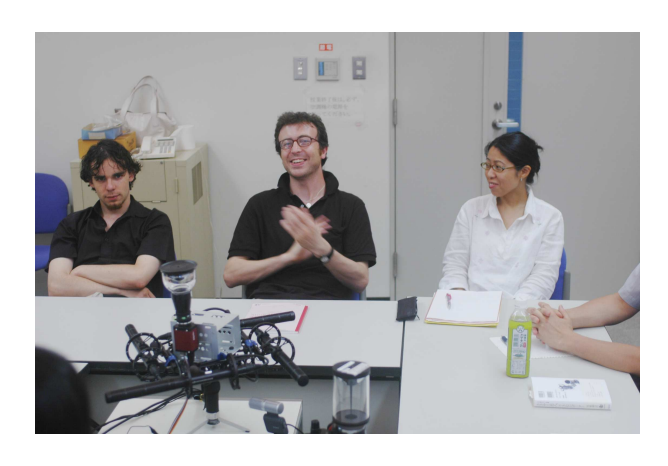
Figure 2: The device is relatively unobtrusive in actual use and does not hamper the interactions

scribing the body, hand and head movements is produced automatically.