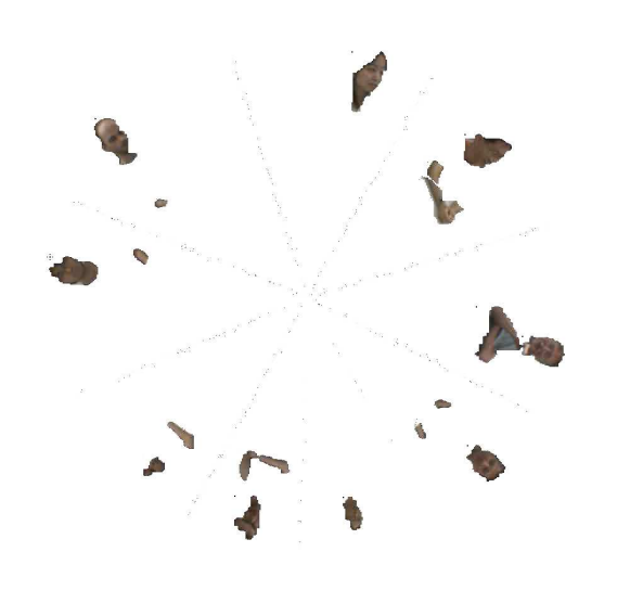
Figure 4: The 360-degree view after skin-tone detection. These are the moving parts that we track

variations in overall sound quality around the table. From this information, in conjunction with the video primitives, we are attempting to produce an estimate of each speaker's activity throughout the meeting.