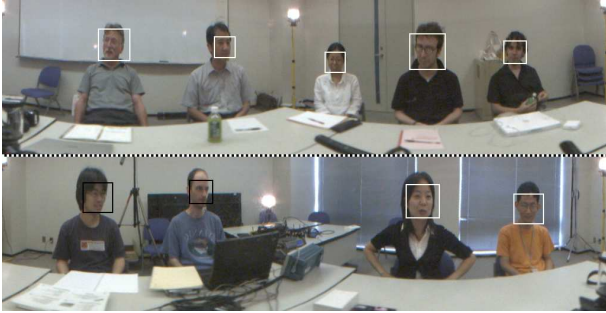
Figure 3: Typical output from the program showing two 180 degrees sections on top of each other. Detected faces are shown with a white square, tracked faces with a black square.